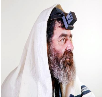
Picture of phylactery